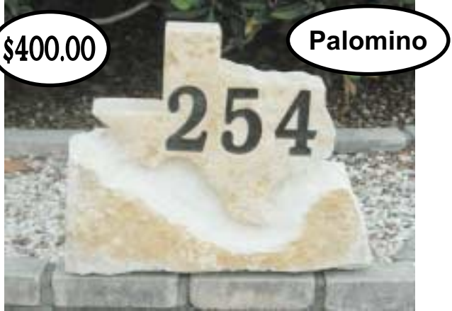
$400.00 Palomino Number Horizontal