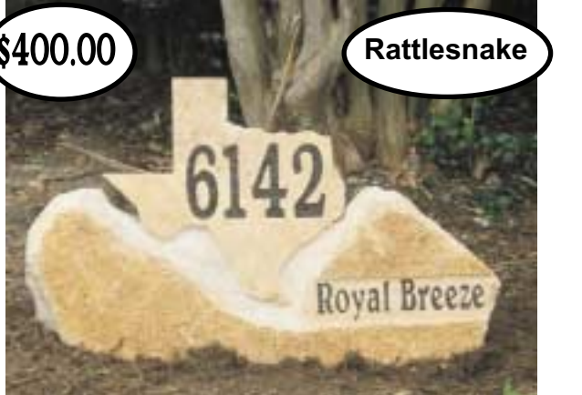
$400.00 Rattlesnake Combo Horizontal