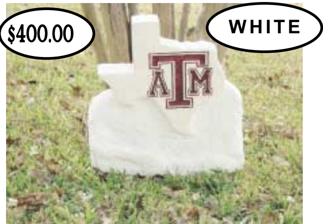
$400.00 WHITE Artwork Vertical